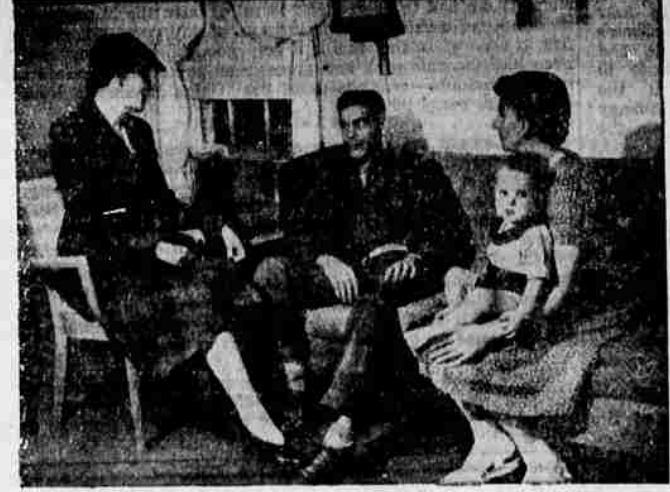
WELCOME BACK INTO CIVILIAN LIFE. The Red Cross provides special information and help for disabled veterans. The Red Cross answers questions about pensions, claims, vocational rehabilitation training. It is authorized to present veterans' claims. The Red Cross is at his side— always!