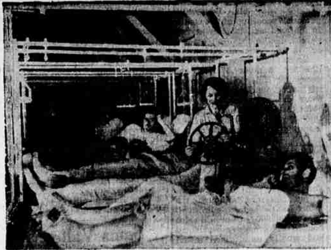
MOVIES IN A HOSPITAL WARD! Mickey Mouse and the latest Hollywood releases do wonders for a fellow with a leg full of shrapnel! And so do books, games, song-fests—stock-in-trade of Red Cross Recreational Workers at home and overseas. Your Red Cross lifts spirits, makes re-adjustments easier, speeds up convalescence!