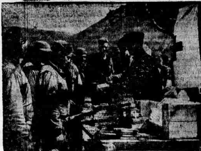
FIELD SERVICE AT THE FRONT! Wherever your soldier or sailor goes, the Red Cross goes, too. Field Directors distribute toilet articles, writing paper, cigarettes to men in the front lines. They maintain contact between these men and their families. In one month in 1944, Field Directors relayed more than 31,000 emergency messages.