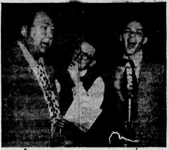
DIFFERENT TYPES but each tops to his respective admirer. Opera star John Charles Thomas and swooner Frank Sinatra meet at the mike and seem to put orchestra leader Vic Young into a state of deep thinking.

JAN GARBER "The Idol of the Airlines" and His ORCHESTRA ARMORY Klamath Falls WED., FEB. 28 COMING APRIL 4 ADA LEONARD and Her ALL GIRL ORCHESTRA