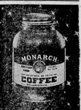
500 other MONARCH Foods—all Just as Good!