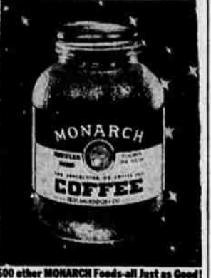
500 other MONARCH Foods—all Just as Good!

The county assessor's office reported today there were still a number of taxpayers in this county who have not filed their personal assessments blanks as required by law. Final day for so doing is Thursday, March 1. New residents are informed that under Oregon law, the taxpayer makes out his own personal assessment and is not called on by deputy assessors as in most states.