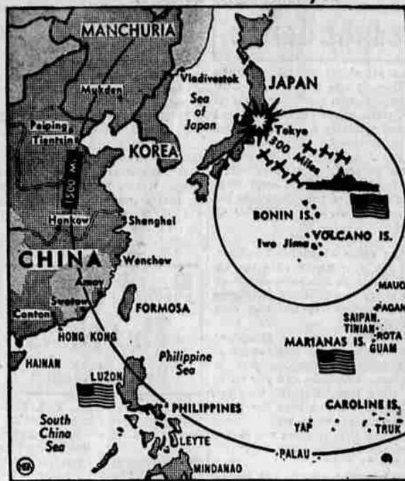
(Acme Telephone) More than 1300 American planes from a huge navy armada only 300 miles off the Japanese coast smashed at the Tokyo area for at least nine hours in the heaviest raid ever made on the enemy capital. Tokyo radio said the attack and the bombardment of Iwo Jima in the Volcano Islands, 150 miles south of Tokyo, "may be prelude to an American landing on Iwo," a constant threat to B-29 Super-Fortresses operating from the Marianas.