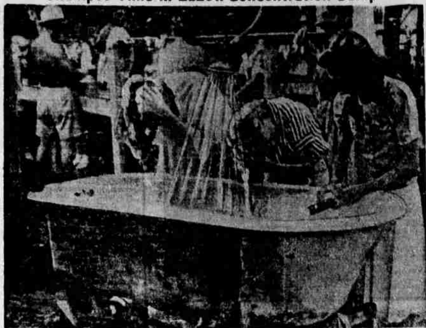
Using an old-fashioned bathtub supported by a rough wooden frame with a crude shower attachment overhead, two women inmates at the Santo Tomas University concentration camp in Manila are shown washing clothes in a metal trough. This photograph was taken by a Japanese soldier, was found in an enemy barracks on Luzon.