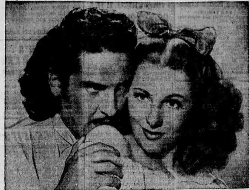
Arturo de Cordova and Joan Fontaine are co-starred in the Technicolor picture "Frenchman's Creek" which arrives at the Craterian Sunday. Players in the supporting cast are Basil Rathbone, Nigel Bruce, Cecil Kellaway and Ralph Forbes.