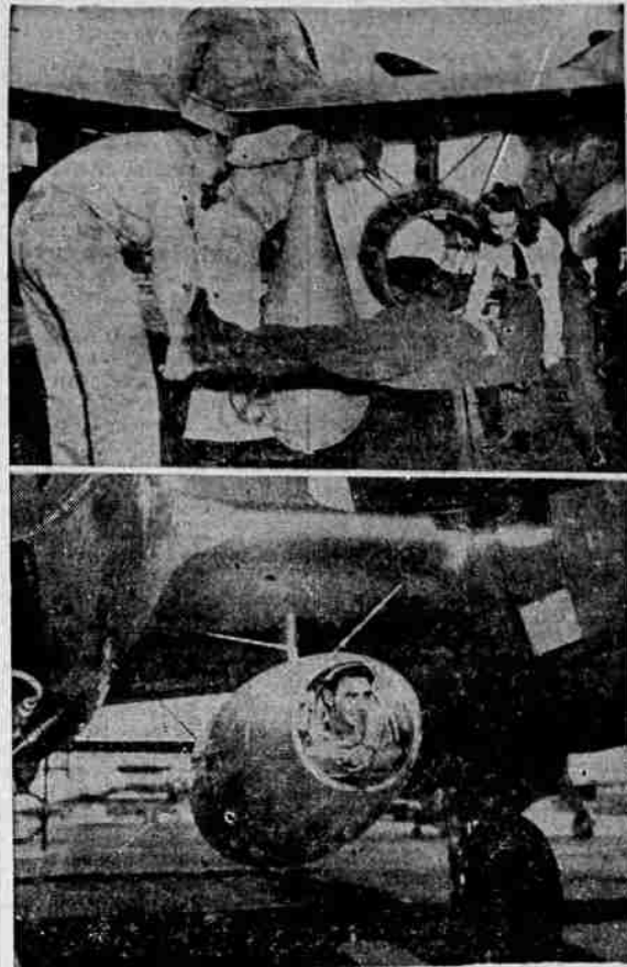
The world's fastest ambulance—a P-38 with belly fuel tanks modified to carry personnel or cargo—is demonstrated at Seventh AAF headquarters, Pacific Ocean Area. The litter "patient" (above) is pushed into the container and the litter fastens on hooks inside the tank. The tank is locked in place when patient is secure. Below, a passenger, resting on mats, looks through the plexiglass nose. Tank is equipped with two portholes, airvents and set of earphones. A similar tank is fastened on other side of cockpit.

duced yesterday included two by the Benton and Lane county delegations which would clear the way for construction of new dormitories and other buildings on the campuses of the state system of higher education.