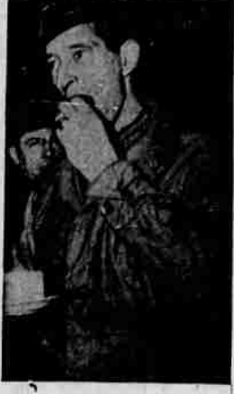
TIME OUT —Even a three-star general deserves some relaxation so Lt. Gen. Mark W. Clark has coffee and doughnut in informal party staged by GIs in Italy.