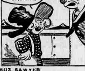
"I CRAVE SOME CHANGIN' CLOTHES, YE SHIFFLESS SKONK!!" "YOU AIN'T NO G. I. JOE." "WELL, WELL!! THEN WE'LL TRENCH 'EM UP LIKE ONE O' THE BOYS." "I ORDER KEPT MY WOODBY TONGUE ATWOXIT MY TEETH." "I'M UTTERLY DISTRESSED, PENFIELD. BUZ SAWYER HAS BEEN HOME NEARLY TWO WEEKS AND STILL HANST PROPOSED TO TUT." "MAYBE SHE SHOULD PROPOSE TO HIM." "DONT BE RIDICULOUS, PENFIELD. A MAN LIKES TO BELIEVE HES THE HUNTER, NOT THE RABBIT." "THEN CUT OUT THE PARTIES NO WONDER HE HANST PROPOSED. HES NEVER HAD A CHANCE TO BE ALONE WITH HER." "AND SO YOUR FATHER AND I DECIDED TO GO OUT TONIGHT, SWEET, AND LEAVE YOU ALONE WITH BUZ—YOU KNOW, BEFORE THE FIRE-LIGHTS DIM... A VIENNESE WALTZ PLAYING SOFTLY AND EVERYTHING JUST RIGHT." "OH, MOTHER, WHY OF COURSE!" "WHO CAN THAT BE, FRINGING OUR DOORBELL AT ONE O'CLOCK IN THE MORNING?" "I'M SELLING GENUINE LEATHER BILLFOLDS." "WHY COME AROUND IN THE MIDDLE OF THE NIGHT?" "EVERYBODY I CALL ON ASKS ME THAT SAME QUESTION." "IT'S JUST THAT IT'D RATHER SLEEP IN THE DAYTIME." "OH, NO, NO, NO!" "WAL-F-RIGHT! BUT AH RECKON AH WILL-SOOKS AH GETS BACK!" "AN AH BETTER BE GITTING LONG NOW, CHILE—TH' MOON'S DIMMIN' OUT—BUT-BEFORE AH GOES—AH GOH—" "TELL—YO—" "SOMETHING." "GRAN—MAMMY? YO VOICE IS GITTING INDISTINK." "THEM CLOES YO IS WEARIN'—IS YO DEATH WARRANT?—GIT RID O' 'EM—BEHEEJUTLY." "AN—ESCAPED BECAUSE BECAUSE." "THAR'S SOMEONE POUNDIN' AT TH' DOOR!" "WHO WAS THAT WHO JUST WHIZZED PAST US?" "IT WAS THE LITTLE OLD LADY WHO LIVED IN A BED SHEET!" "I CAN JUST SEE THE SIGN 'MUGGINS HEALTH INSTITUTE'." "LET'S GO TO ME BANK AND ARRANGE TO LEASE." "WHERE'S HE GETTING THE MONEY?" "I'M BACKING HIM AND PROTECTING MYSELF WITH A CHATTEL MORTGAGE." "HE DONT LOOK LIKE A GOOD RISK TO ME." "MUGGINS IS OKAY AND HE KNOWS HIS BUSINESS." "MARK MY WORDS, HE WILL GO PLACES!" "BE CAREFUL BY HESS!" "HE DONT GO PLACES WHERE YOU CANT FIND HIM—WITH YOUR DOUGH!" "CRAZY" "UNWELCOME VISITOR" "PLAYING HAPPILY WITH HIS EYES WHEN VISITOR COMES IN KNOWS SHE'S HERE TO LOOK HIM OVER AND RETURN THE COMPLIMENT." "AFTER STUDYING HER, DECIDES AFTER CAREFUL THOUGH, THAT SHE DOESN'T GET HIS VOTE." "TREMBLES LOVES UP TO INDICATE AS FAR AS HE'S CONCERNED THE INTERVIEW IS OVER." "IT DOESN'T WORK, PUTS ON THE NEXT PAGE IN HIS REFLECTORY." "POSES FINER IN HIM TO MAKE HIM SMILE, LETS HER HAVE IT." "THAT DOES IT, GLAD HE HANST LOST KNACK OF GETTING RID OF UNWELCOME VISITORS." "L'L ABNER" "THE NEBBS" "BLONDIE" "BUZ SAWYER" "LITTLE BOBBY" "THE GRANGE" "BUTTE FALLS" "SAMS VALLEY" "SLICK CHICK" "UNWELCOME VISITOR" "TO SIGN BOY STARS" "RELIEF AT LAST FOR YOUR COUGH" "CREMULON" "PENETRO" "CRAZY" "UNWELCOME VISITOR" "TO SIGN BOY STARS" "RELIEF AT LAST FOR YOUR COUGH" "CREMULON" "PENETRO"

Do you know? That one tire manufacturer recently produced its 100,000,000th pound of synthetic rubber, enough for nearly 10,000,000 tires of the most popular size. The War Machine uses most of these tires.