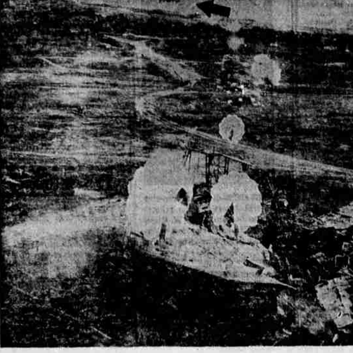
Sweeping ahead of American invasion troops, B-25s of 13th Army Air Force stage a low-level attack on Clark Field, near Manila, wrecking buildings and ground installations, blasting grounded planes. Note bomber at top (arrow) and parafrag exploding in center background as other bombs fall. Army Air Force photo.