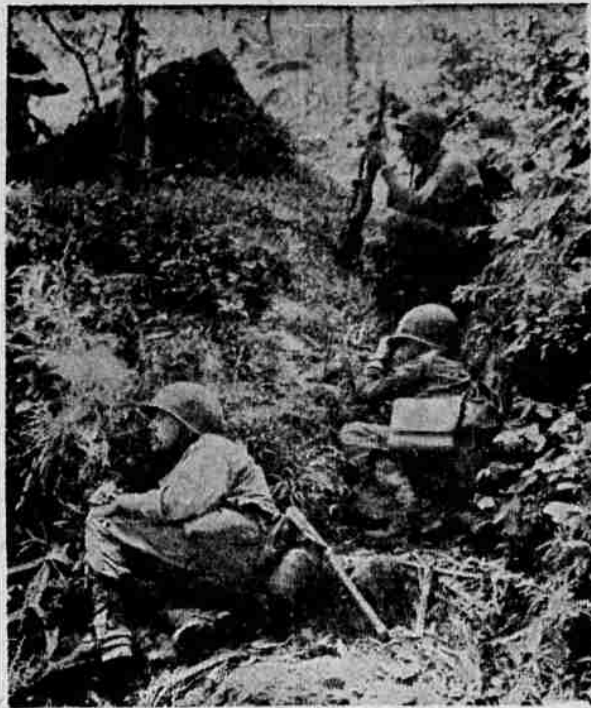
American infantrymen advancing on Luson plains past San Jacinto, really hug the earth in this gully as Jap artillery opened up on them. They had just participated in capture of town when Japs started shelling.

But of the more than 700 tanks committed for the offensive, between 500 and 600 were estimated conservatively to have been wrecked so far by American ground forces and planes. Among the enemy tanks knock-