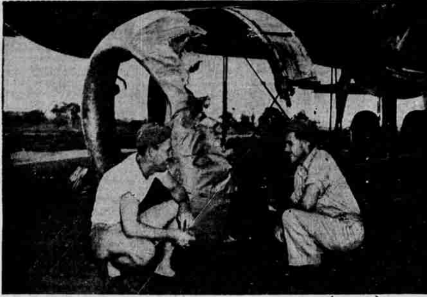
RAMMED BY JAP PLANE —Officers examine damaged engine cowling of their B-29 Superfortress after a Jap Tony fighter plane had crashed head-on into the engine while ship was on mission over Japan. Nip's wing sheared off, it crashed into another Jap plane and both fell.

With Its Weak, Nervous "Dragged Out" Feelings? If at such times—you like so many girls and women suffer from cramps, headache, backache, feel tired, restless, a bit moody—all due to functional periodic disturbances— Start at once—try Lydia E. Pinkham's Vegetable Compound to relieve such symptoms. It's famous not only to help relieve monthly pain but also accompanying tired, weak, nervous feelings of this nature. This is because of its soothing effect on one of woman's most important organs. Taken regularly—Pinkham's Compound helps build up resistance against such symptoms. Follow label directions. LYDIA E. PINKHAM'S VEGETABLE COMPOUND