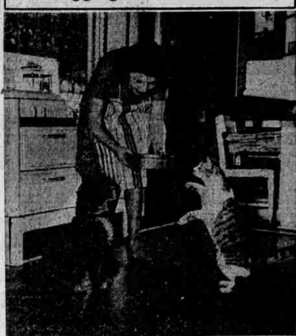
When you save and turn in used kitchen fats, you are doing a good turn for your household pets, because the by-products of used fat are necessary ingredients in prepared animal foods.