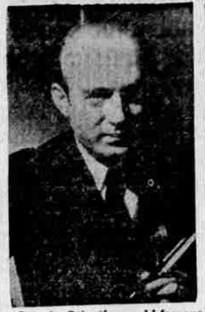
Joseph Szigeti, world-famous violinist, will give the first concert of the 1945 season for the Jackson County Civic Music association here Thursday evening at the high school auditorium.