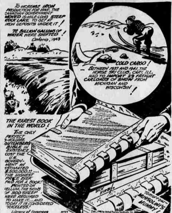
THE RAREST BOOK IN THE WORLD!