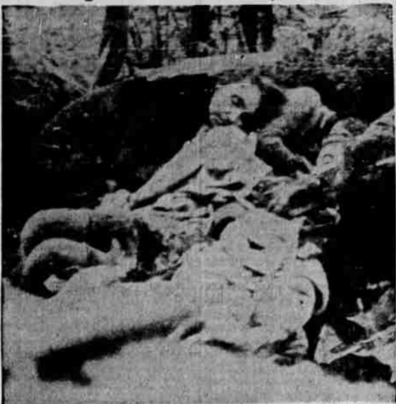
This heap of dead women and children in Belgian town of Stavelot gives mute evidence of brutal atrocities committed by the German army in its western front drive.

On the Radio Chain STATIONS: Chain affiliation and where they are on the dial: KALE (CBS) 1330, Portland KEX (NBC-Blue) 1190, Portland KGA (NBC-Blue and MBS) 1310, Spokane KGO (NBC-Blue) 810, San Francisco KGW (NBC-Red) 820, Portland KJW (NBC-Blue) 1030, Seattle KXN (CBS) 1970, Los Angeles KOA (NBC-Red) 850, Denver KOB (CBS) 970, Portland KOMO (NBC-Red) 930, Seattle KPD (NBC-Red) 880, Salt Lake City KSL (CBS) 1160, Salt Lake City Time shown is PWT