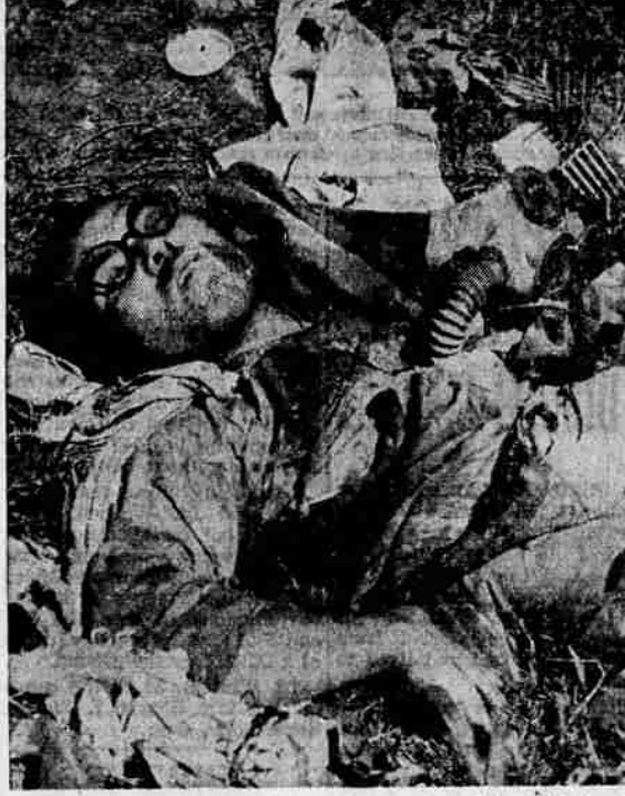
This dead Japanese soldier, victim of American naval fire in the assault on the Ormoc sector of Leyte Island, has scattered equipment about but still wears glasses over his sightless eyes. Americans took heavy toll of Japanese in Leyte corridor.