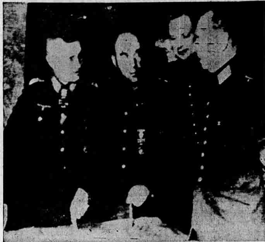
Field Marshal Walter Model (left) and Marshal Karl von Rundstedt (extreme right) and other high-ranking German staff officers study map of their great counter-offensive against the Allies at West Western Front headquarters, according to German caption accompanying this radiophoto from a neutral source.