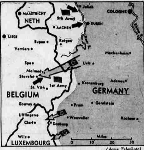
Counter-attacking Germans plunge to Stavelot, 30 miles inside Belgium, recapturing the important base of Malmédy. Other Nazi advances were made in Luxembourg. Exact progress of enemy drive is cloaked in security silence. Shaded portions on map indicate American positions before present counter-assault opened.