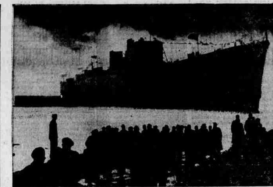
BRITAIN'S BIGGEST BATTLESHIP—This dreadnaught, greatest ever built in England, has just come down the ways as it was launched under the sponsorship of Princess Elizabeth. The big ship went into the water without a name—at least, the name was not revealed at the time of launching! But it will speak for itself.