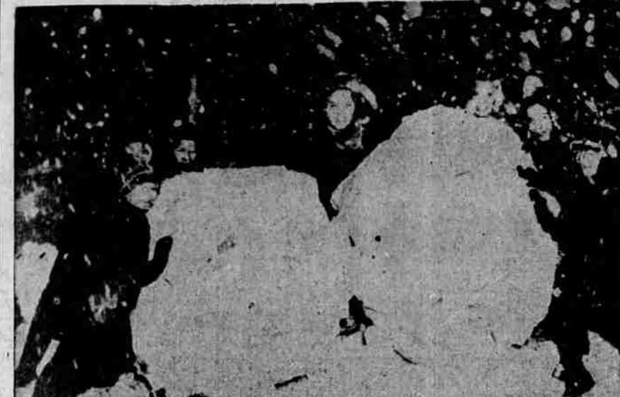
Moist, slushy snow, 10 inches deep in some areas, provides fine material for snowballs for these Chicago youngsters but caused extremely hazardous traffic conditions and delayed arrival of trains by as much as six hours. At least 15 deaths were attributed to the Midwest and Western storms that brought snow to Birmingham, Ala., and Atlanta, Ga.

electoral choice in European nations, and is not compromised by underhandedly or timidly aiding the Russians against the British or vice versa, or blinding our public from the realization these are the forces involved in the present struggle in occupied countries.