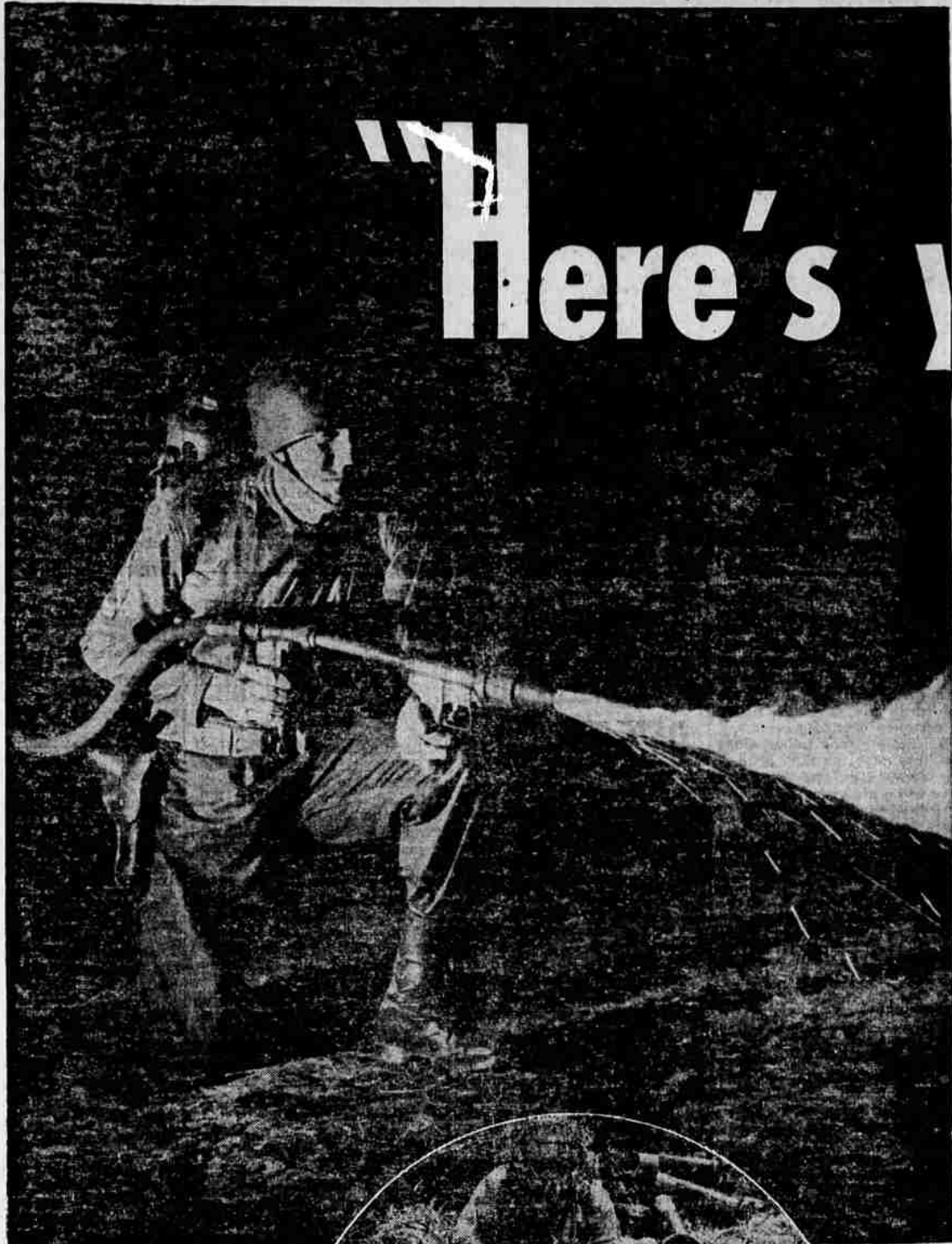
The flame thrower, one of the new basic infantry weapons to be explained and demonstrated in "Here's Your Infantry."

On every land front the war is now in the Infantry stage. There are millions of men in the Infantry and this is your opportunity to see Infantrymen in action with their weapons. The Infantrymen have a tougher, dirtier and grimmer job to do than most others in this war. Now you can see them in battle action, inspect and handle their equipment and find out why we must buy more War Bonds to keep them fighting. Every piece of equipment in the show is placarded with its cost in War Bond dollars.