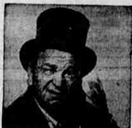
On the screen at the Craterian this week is Wallace Beery in "Barbary Coast Gent," with Binnie Barnes in the cast.

escaped and hiked to the front. He admitted that it was not until he became convinced recently that Germany was finished that he decided to attempt to reach American lines.