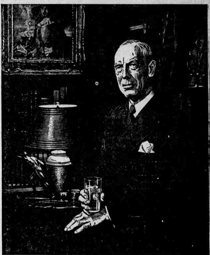
For Men of Authority... LORD CALVERT

of a broadside from the five inch guns of a destroyer. The disclosures were made by the navy following the announcement that it plans to increase rocket production by nearly 300 per cent within the next few months. Naval rocket production already has made great strides, with November output registering a 262 per cent gain over June. Red Marshal Ivan Konev's Ukrainian Army is using United States Army Ordnance trucks, for whose six wheels, four gears and sturdiness Red officers profess high regard. The Russians have also found army jeeps successful mud buggies in their victorious advance on Berlin.