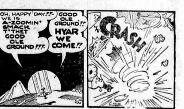
OH, HAPPY DAY!! GOOD OLE GROUND!!