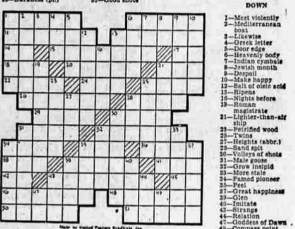
ANSWER TO PREVIOUS PUZZLE

ACROSS 1—Game played with dice 6—Fixed look 11—Town on Burma Road 13—Kettle drum 14—Toward 17—Not lawful (abbr.) 18—Group of tennis games 20—Trying tool 21—Hit 22—Cyprian goddess 24—Roman bronze 25—Court attendant 26—Darkness (pl.) DOWN 2—Pail handle 3—Moderate 30—Move smoothly 31—Places 32—Talking bird 34—Polon 35—Chum 36—European apple 38—A number 39—Device to shut off water 41—Nothing 42—Electrical unit 43—Rover's aid 44—Sewing tool 45—Giltens 46—Wear a way 47—Good shots