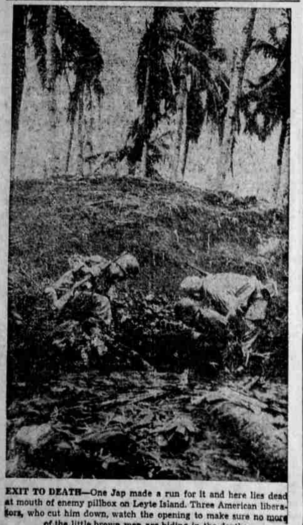
EXIT TO DEATH —One Jap made a run for it and here lies dead at mouth of enemy pillbox on Leyte Island. Three American liberators, who cut him down, watch the opening to make sure no more of the little brown men are hiding in the death.