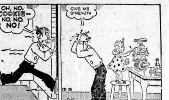
OH, NO, COOKIE--NO, NO, NO!