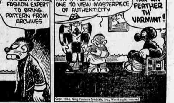
MAY IT PLEASE EMINENT ONE TO VIEW MASTERPIECE OF AUTHENTICITY