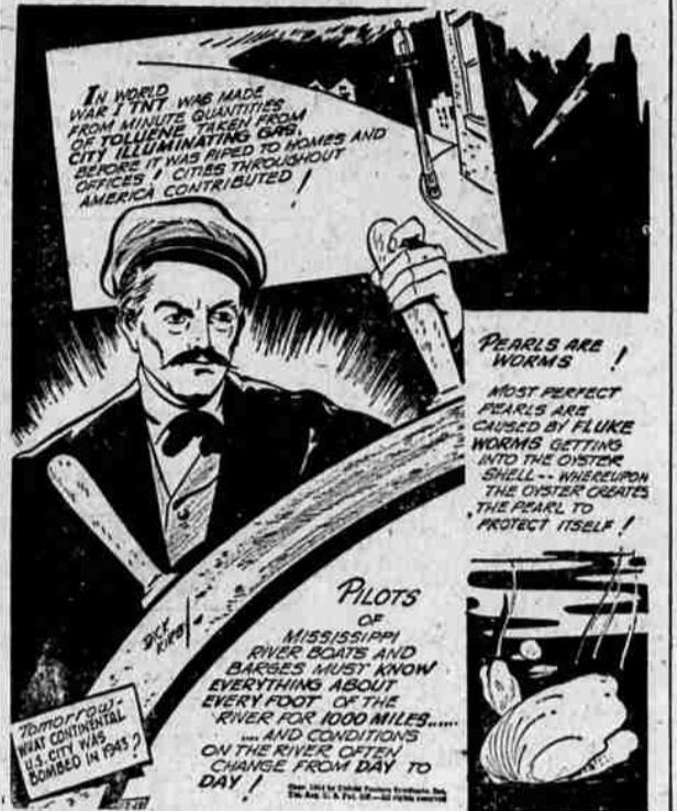
PEARLS ARE WORMS! MOST PERFECT PEARLS ARE CAUSED BY FLUKE WORMS GETTING INTO THE OYSTER SHELL... THE OYSTER DIGESTS THE PEARL TO PROTECT ITSELF!

PILOTS OF MISSISSIPPI RIVER BOATS AND BARGES MUST KNOW EVERYTHING ABOUT EVERY FOOT OF THE RIVER FOR 1000 MILES... AND CONDITIONS ON THE RIVER CHANGE FROM DAY TO DAY!