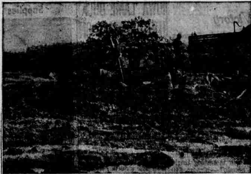
LONG TOM ON THE MUD FRONT—American First Army fighters move their 155mm. Long Tom across muddy ruts of a battlefield in France as they launch an all-out drive into Germany.

The signing of the Franco-Russian pact probably will be followed soon by the signing of a parallel Anglo-French alliance. The text of the Franco-Russian agreement was not released, but an announcement in Moscow said the two countries had "re-affirmed their determination to continue military operations up to complete victory over Germany and their desire to take all necessary measures in common for safeguarding Europe from new aggression."