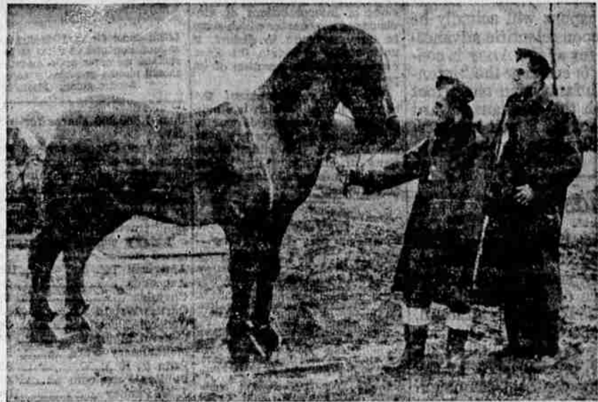
NOT IN GREECE, EITHER—Allied airmen smile as they examine dummy horse placed on airfield in Holland. Nazis scattered phony cattle all over the field as camouflage to confuse airmen flying on missions over the area, but our boys didn't fall for it.