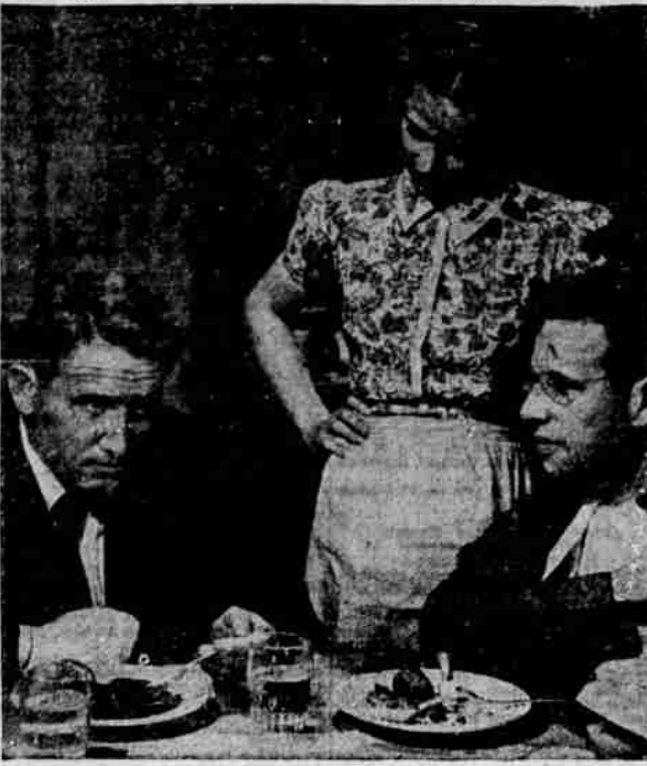
Spencer Tracy figures the next move in his escape from the Nazi concentration camp in this scene from the stirring drama, "The Seventh Cross," with Signe Hasso, Hume Cronyn, Jessica Tandy and Agnes Moorehead. The film starts at the Craterian Sunday.