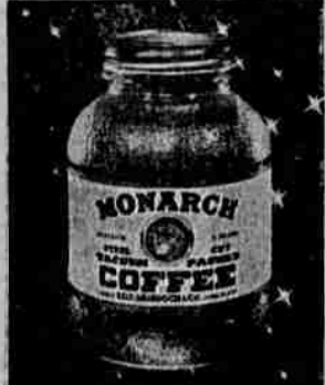
600 other MONARCH FOODS—all just as Good

sary energy, vitamins and minerals that will keep your child alert and happy until dinner-time? The four point pattern for the carried lunch as explained in home economics mimeograph 1864 will help you plan "the lunch that packs a punch." This plan is based on the following four points: 1—one cup of milk in some form. 2—a vegetable or fruit or both. 3—whole grain or enriched bread or cereal products and 4—a food rich in protein. Does your lunch box provide a square meal every day? Anyone who has to pack a lunch will find this new bulletin on "The Carried Lunch" HE 1864, very helpful. It is available free of charge through the office of the Home Demonstration agent in the courthouse. Of particular help will be the 94 different combinations for sandwich filling that are listed, along with each of the other three points in providing a better carried lunch for children and adults.