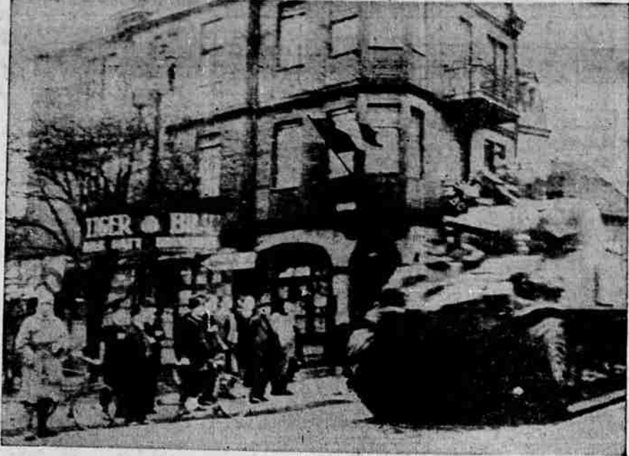
Flying the Tricolor, a tank of Brig. Gen. Le Clerc's French Second Tank Division rumbles down a street in the heart of Strasbourg, Alsace capital city now firmly in Allied hands. French armored forces and American ground troops, fighting shoulder to shoulder, finally took the Nazi stronghold.

In an address to the people's political council in Chungking, He likened China's position to that of the United States after Pearl Harbor and called on all free China to co-operate with the newly-organized Chinese war production board in meeting industrial goals.