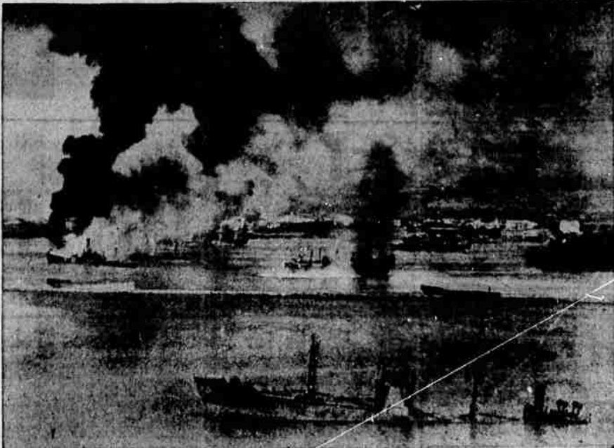
Destruction of Japanese shipping in Manila Harbor is dramatically illustrated in this photo, taken at height of recent strike by carrier-based planes of U. S. Pacific Fleet. Cargo vessels such as these battered ships are needed desperately by the Japs. make prime targets for American bombs and torpedoes.