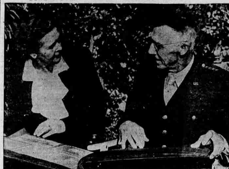
Enjoying a well-earned rest at his Carmel, Calif., home, Gen. Joseph W. "Vinegar Joe" Stilwell and his wife look over scrapbook that Mrs. Stilwell kept for him during his long stay in China before his removal as commander of the China-Burma-India theater.