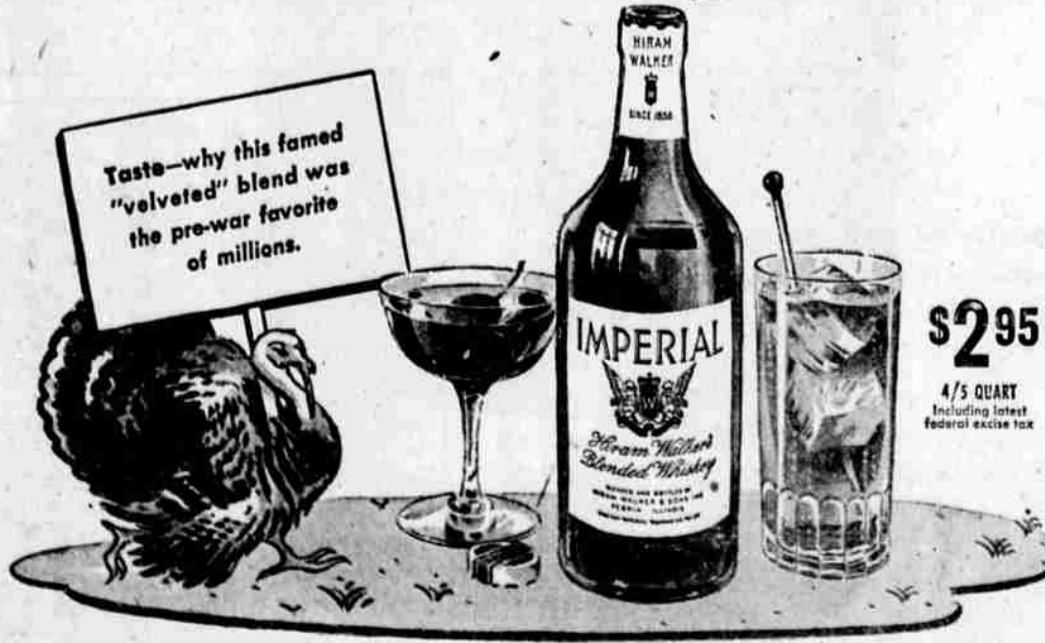
Imperial is Hiram Walker's blended whiskey. 86 proof 70% grain neutral spirits. Hiram Walker & Sons Inc., Peoria, Ill.