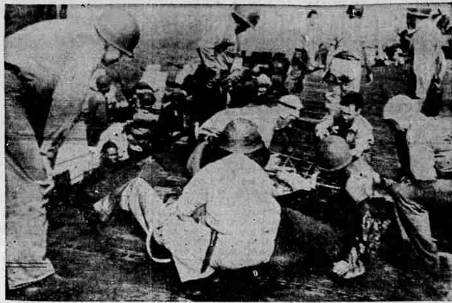
Wounded during furious Japanese attack against their aircraft carrier, these Navy gunners are given first aid by hospital corpsmen and shipmates during Second Battle of the Philippine Sea. At least 48 enemy warships were hit and sunk in this battle, one of the most decisive of modern times.

numbers, familiar operatic quartets and duos.