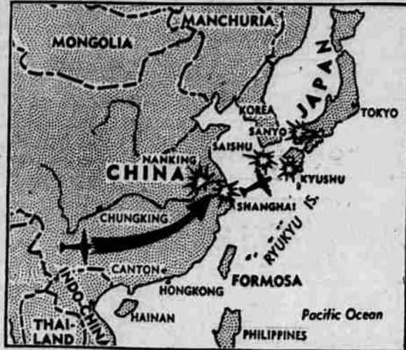
Super-Fortresses were on the loose over the Japanese Empire. Targets included Nanking and Shanghai in occupied China, and Kyushu, Saikyu and Sanja in Japan proper.