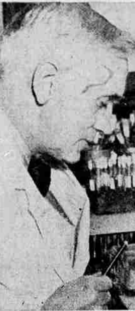
Sir Alexander Fleming (above), discoverer of penicillin, has been awarded this year's Nobel prize for medicine, according to the Swiss radio.

for nearly 3,000 homeless. At least 700 residents of the burned-out area were housed at Willson junior high school.