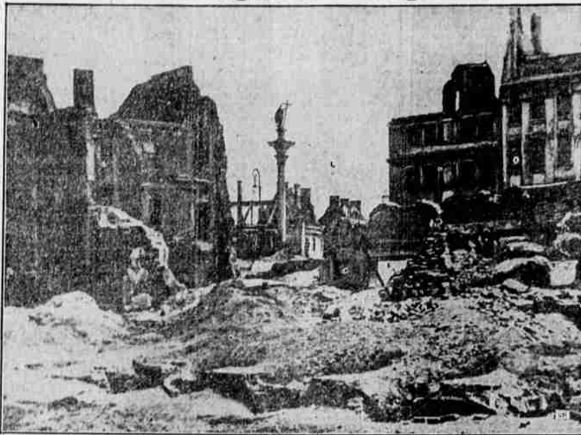
ONCE THE GAY AND BEAUTIFUL CAPITAL OF POLAND, Warsaw now lies in ruins. Devastated by three weeks of siege in September of 1939, and martyred by five years of German occupation, Warsaw again became a battleground in August of this year when the people of the city rose against the Germans. Here is a view of Nowa Sieniorska Street showing King Sigismund the Third's column on Castle Square.