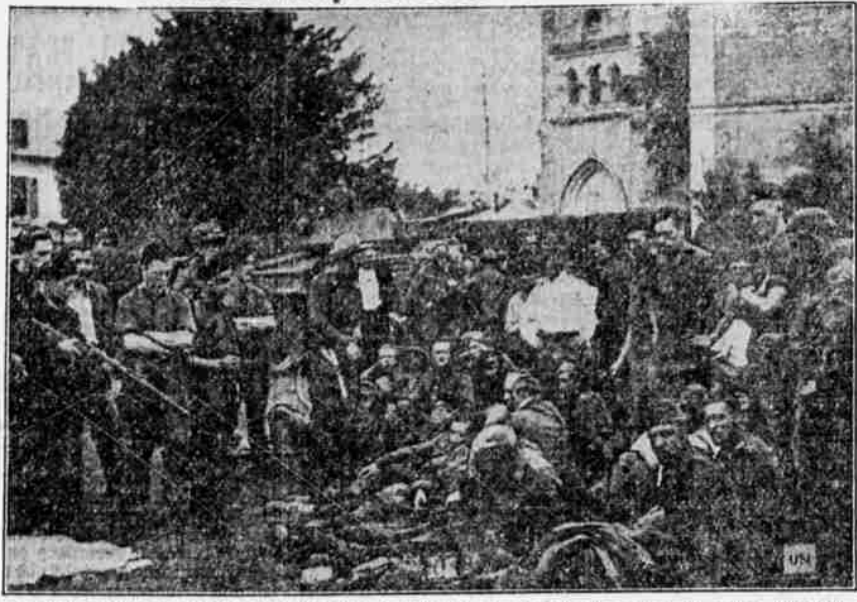
ON THE VILLAGE GREEN BEFORE THE CHURCH in the French village of St. Opportune, this picture taken during the rapid advance of the Allies across northern France, shows a typical instance of the co-operation given by French patriot forces. A British reconnaissance force has reached the village with its armored cars. The Tommies have dismounted and can be seen with local Maquis guarding German prisoners.