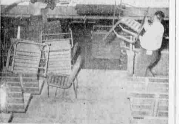
Once an aircraft parts storage center, Hollywood Park, Hollywood, Calif., spruces up its appearance for forthcoming Nov. 1 opening for racing—the first meet in Southern California since 1917.