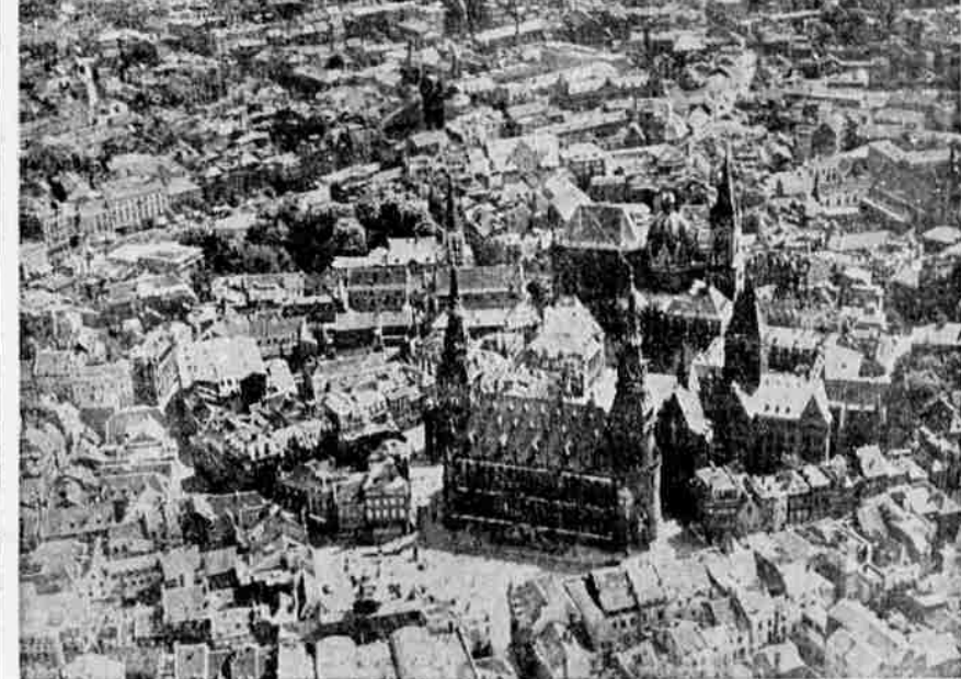
Aachen—better known to most persons in pre-war days as Aix-La-Chapelle—faces complete ruin following German defiance of American surrender ultimatum. Famous as headquarters of Charlemagne, the historic city contains a 1148-year-old cathedral and a 14th Century Town Hall. Hundreds of American guns have already begun the systematic destruction of the city.