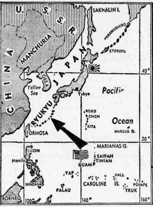
Hundreds of carrier-borne American planes, ranging within 200 miles of Japan, struck at the Ryukyu Islands in their boldest attack of the Pacific war, destroyed 89 planes and sank or damaged 58 ships. The attack failed to bring any immediate response from the imperial fleet and only feeble resistance from the air.