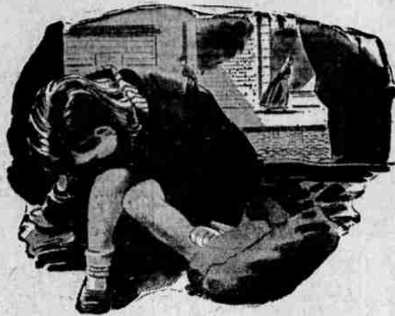
A little child collapses on the streets of Athens. A little medicine and food would save her—and YOU have the power and opportunity to save her—and thousands more like her in war devastated lands. Will you help? Of course you will!