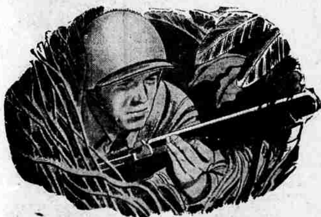
A God-forsaken South Pacific post, populated mostly with Marines, mosquitoes—and Japs. There is nothing to do between battles. Will you provide the boys with shows—pass out cigarettes, chocolate and "cokes"? Of course you'll help these guys who are fighting YOUR fight!