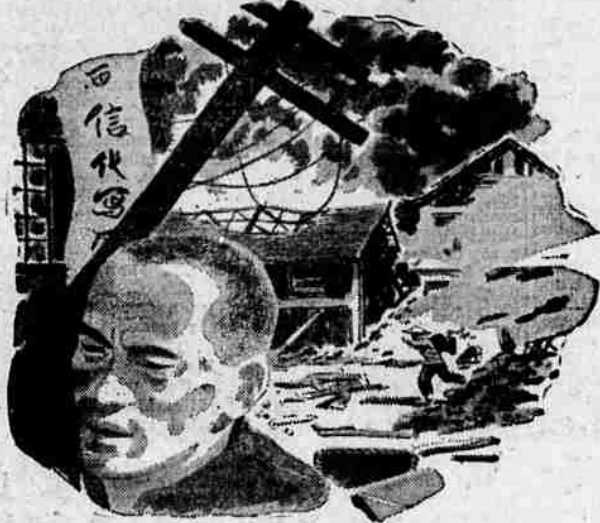
The rubble remains of a little village in China, visited by the "Sons of Heaven." People are freezing for lack of fuel, starving for lack of food, dying because there isn't enough medicine to fight disease. For five long years they've been fighting OUR foe. Will you keep them fighting . . . on our side? You will!