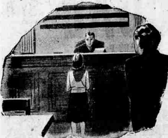
Right back home a scared, sullen youngster stands before the magistrate—another case of wartime juvenile delinquency. Father in the service, mother in war work, the home disrupted. Here, on the home front, the children need help and friendly guidance. Will you see that they get it? You CAN through the Medford Community and War Chest!