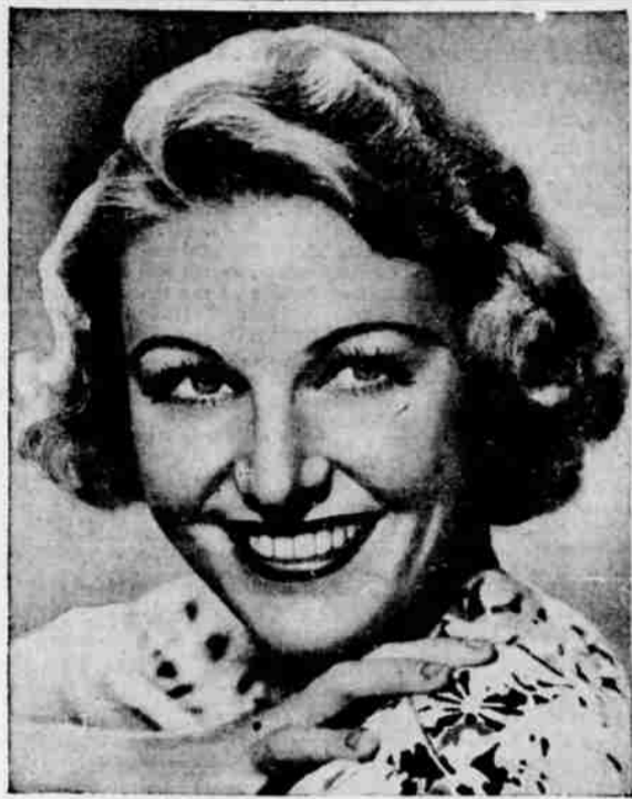
Florence Rice (above), one of Hollywood's bright stars, and daughter of Grantland Rice, famous sports commentator and writer, who has just completed the purchase of 105 acres on Rogue river in the Sams Valley district.

Former Morrill Property Show Place in Boom Days—Plans Fine Home.