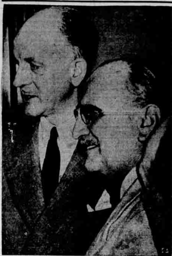
Sumner Welles (left), U. S. undersecretary of state, and Enrique Ruiz Guinazu (right), Argentine foreign minister, during the Pan American conference at Rio De Janeiro in which Argentina now has joined other American republics for a unanimous stand against the axis powers.