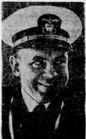
Lieut. John D. Bulkeley (above), is this nation's newest hero. The U. S. Navy put him on its honor roll for rocketing a torpedo boat into Binanga bay, in the Philippines and torpedoing a 5,000-ton Jap vessel.

Now his legation, its doorway surmounted by the figure of Garuda—half man, half bird and an omen of good fortune—hums with activity as he prepares for history a paper destined to prove to the world that Thailand is a nation of free people, imbued with democracy, and hating the Japanese.