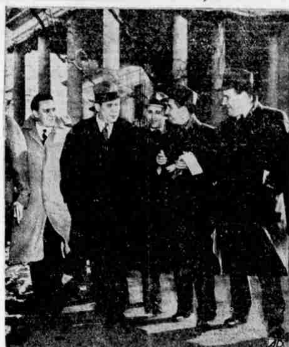
After talking with President Roosevelt about his new job as umpire to help the new war labor board, Wendell Willkie was interviewed almost on the run as White House reporters escorted him down the front drive from the executive mansion, shown in background.