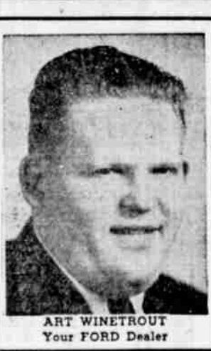
ART WINETROUT Your FORD Dealer

The mountain playgrounds in the Colorado Rockies are five times larger than all Switzerland.