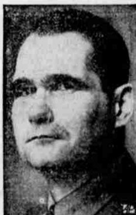
FLIGHT Still England's war prisoner, Rudolf Hess (above), No. 3 Nazi, flew some 800 miles from Germany to Scotland where he surrendered to a farmer May 10. Stalin claims Hess sought to line up British and U. S. against Reds. Some think he brought peace bid.