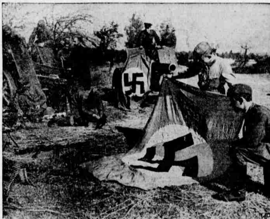
NAZI UPSET A powerful Russian offensive, plus sub-zero cold that the Reds blithely called a frost, in December reversed the German drive on Moscow, left Nazi booty or Russians (above). Hitler, who'd disposed of Yugoslavia and Greece in a month, April, invaded Russia June 22. His supply-hungry troops found factories razed, fields laid waste. So complete was the rout of Nazis that Hitler, answering what he said was an "inward call," assumed command of German armies Dec. 19, ousting von Brauchitsch. For her part in war, Finland lost U. S. friendship.