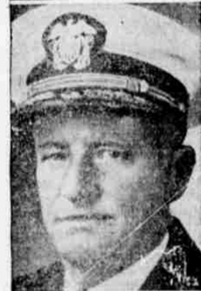
RANK In shakeup after attack on Hawaii, Admiral Ernest J. King (top), 62, of Ohio, became commander of entire U. S. fleet in charge of all operations; Rear Admiral Chester W. Nimitz (lower), 56, got command of Pacific Fleet.