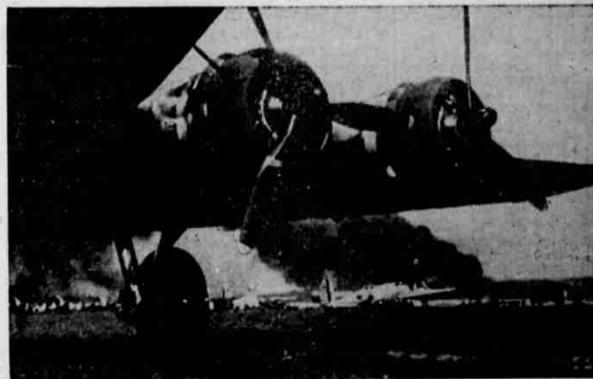
BOMBERS ABLAZE Smoke from blazing B-17 bombers, caught aground by Japan's surprise assault Dec. 7 on Pearl Harbor, Hawaii, curls up past one bomber that escaped damage. In this attack, staged even as Japan's "peace" envoy Kurosu was seeing Hull, some 2,897 soldiers and sailors were killed, and the battleship Arizona, three destroyers, a target ship, a mine layer and "other vessels" were sunk. A 5-man board headed by Supreme Court Justice Roberts will study Hawaii's lack of alertness, as discovered by Navy Secretary Knox on his inspection tour. Knox also reported finding evidence of "most effective fifth column work of war."