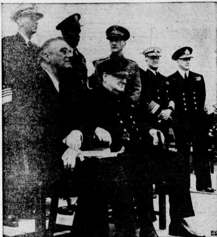
SEA RENDEZVOUS Calm was the Atlantic in August when Roosevelt, the nation's first third-term president, and Churchill met aboard the battleship Prince of Wales, later sunk, to formulate eight war aims, chief of which is "destruction of Nazi tyranny." In December, the two nations thus represented were full-fledged allies in World War II, and on Dec. 22 Churchill, accompanied by Lord Beaverbrook and a technical staff, arrived at the White House to "discuss with the President all questions relevant to the concerted war effort."

Associated Press Telemats Summarize Historic Events