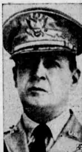
CHIEF On canny, blunt Gen. Douglas MacArthur, who on Dec. 18 inducted entire Filipino army into the U. S. army, rests burden of directing defense of Philippines against Japanese bombings and invasion attempts aimed chiefly at Manila and Luzon Island.