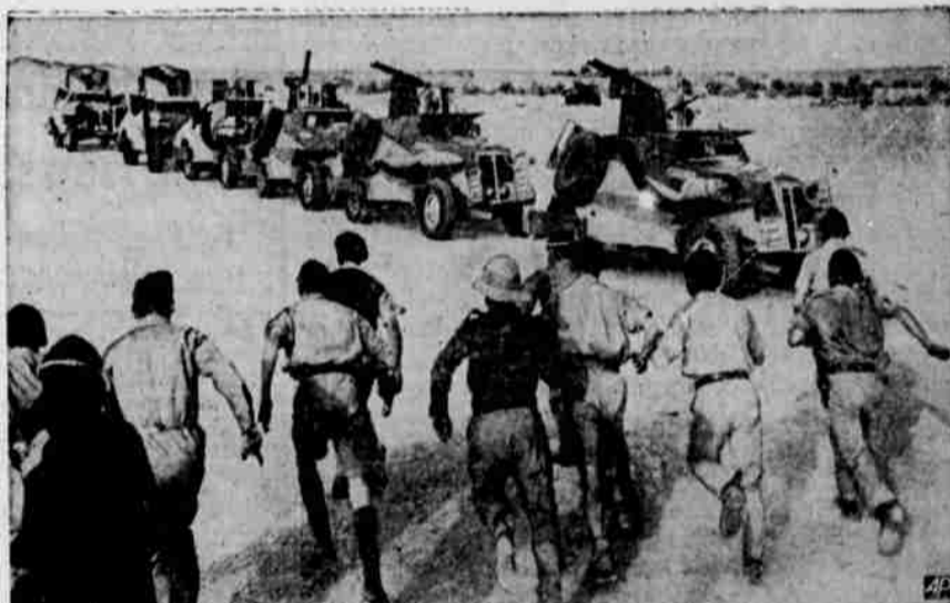
DESERT DASH Britons engaged in driving Axis out of Libya, possibly before Nazis could bolster flagging efforts and create new threats to Suez and the Mediterranean, hurry into action. In this drive the British garrison at Tobruk, under Axis siege since April 12, was relieved. Nazi pressure on France which has a fleet as well as strategic bases on the African coast—Dakar is 1,620 miles from Natal, Brazil—may have helped speed up the British clean-up campaign. In April, Haile Selassie regained Addis Ababa and the kingdom Italians took in May, 1936.