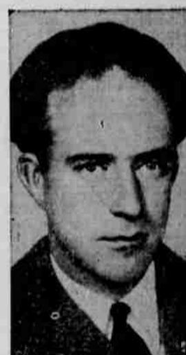
LOVE King Leopold (above) of Belgium, whose first wife, Queen Astrid, died in an auto accident in 1935, on Sept. 11 wed a commoner, Mary Baels. Since May, 1940, Leopold has been a war prisoner in own land, living near Brussels.