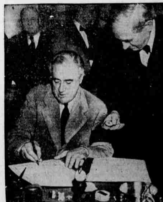
WAR Discord in U.S. on which the Axis may have been counting melted swiftly after war declarations—against Japan Dec. 8, against Germany and Italy Dec. 11 (above). "America First" dissolved; Lindbergh called for "united Americans"; Isolationist Sen. Wheeler said of Japanese: "We must lick hell out of them." Latin American nations meet in January.