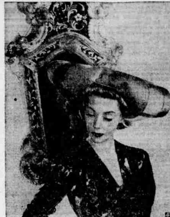
FELT TRAVELOGUE —Whether north or south, town or resort, this beige felt hat shows decided talent for wear with either print dresses or dark furs. The brim can be adjusted at will. Is best worn far back to reveal the forehead and hair.

Howard District —Howard District P. T. A. has called a special defense meeting in the school gymnasium Monday at 7:30 p. m. in compliance with the request of the Jackson County Council of Defense. All in the neighborhood are urged to attend in order to receive instruction and information regarding proper procedure in case of an air raid.