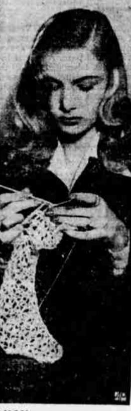
BUSY —Between scenes on a movie lot in Hollywood, Veronica Lake, the tiny blonde who may popularize that shoulder-length hair bob again, keeps busy with a personal assignment of crocheting handwork. Says she finds it helps relax her nerves.