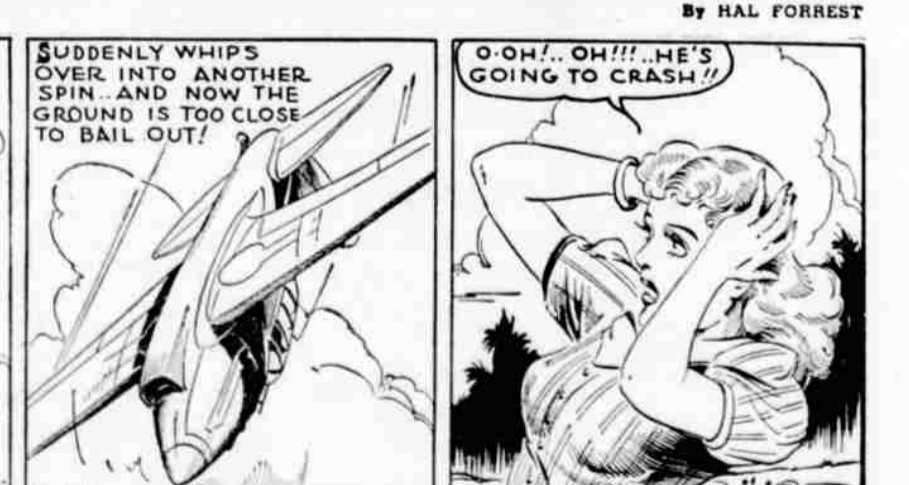
By HAL FORREST