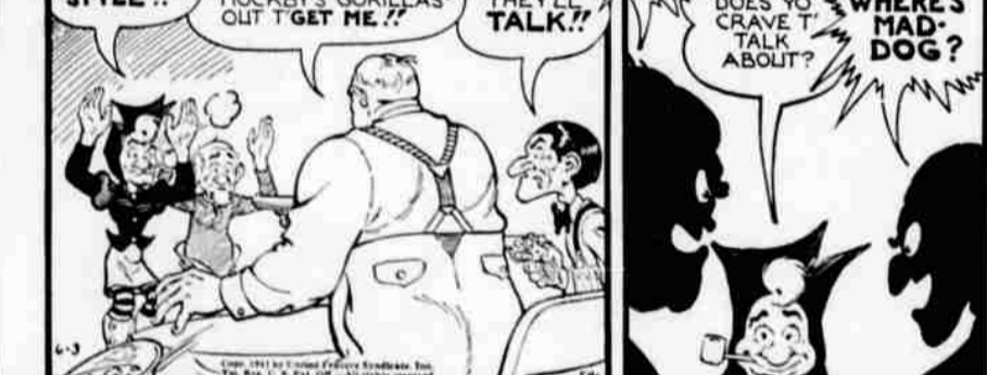
TAILSPIN TOMMY Heading For a Crash