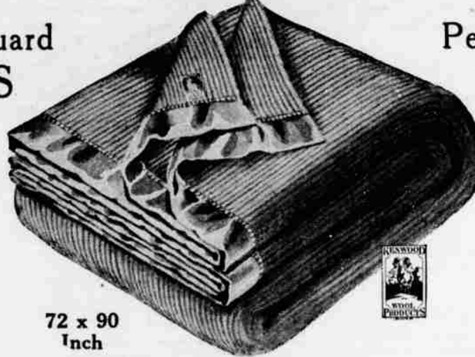
72 x 90 Inch