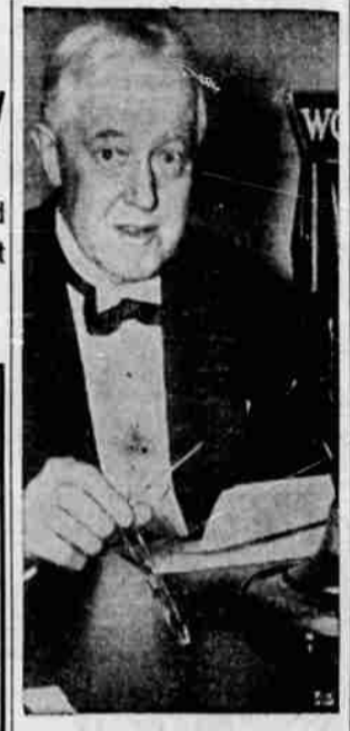
John W. Davis speaks via radio from Albany, N. Y., joining two other former Democratic presidential candidates in appeals to the nation for unity during a national emergency. Alfred E. Smith spoke from New York and James M. Cox from Dayton.