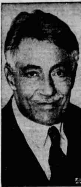
IMPROVING—Fritz Kreisler, 66 (above), renowned violinist who suffered a skull fracture in a New York traffic accident, is improving. He was a captain in the Austrian army during the first World War.