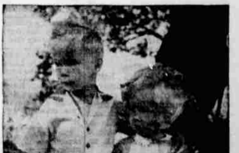
The youngest Days did stand-in duty for their mother, who didn't want to be photographed.