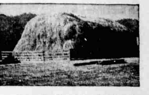
The result of the vetch-hay harvest.

Corn is but one of the new side lines which are developing on the Day place. In addition to the corn planting there are about 25 acres of alfalfa seed, 17 acres of vetch seed, and 15 acres of Rex wheat for seed. With it all the cattle business is being expanded both in size and quality. With more intensive cultivation of better kinds of feed, and the elimination of the male and the one which makes up the four rows is the female. This is accomplished by removing the tassels from all female stalks, so that they become incapable of shedding pollen on the silk of their own ears. This job takes one man's full