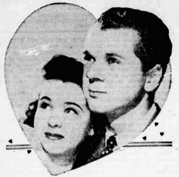
Jane Withers and Jackie starred in "Her First Beau." Cooper, two of Hollywood's most popular young stars, are co-stars for Sunday and Monday.